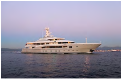
Lürssen 68m Global after her refit