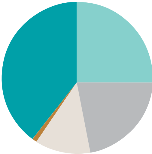
FOR A 50M+ A FEW YEARS INTO OPERATION: